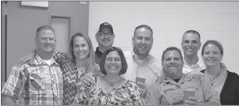
Members of the Class of 1989 (left) and the Class of 1979 (right) enjoy "re-union" during the Summer Block Party