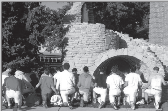
The Our Lady of Lourdes Grotto remains the center for prayer, today, as in past generations