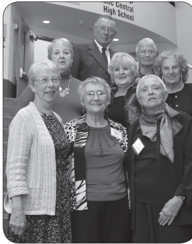
Members of the Class of 1952 celebrate their 60 year reunion