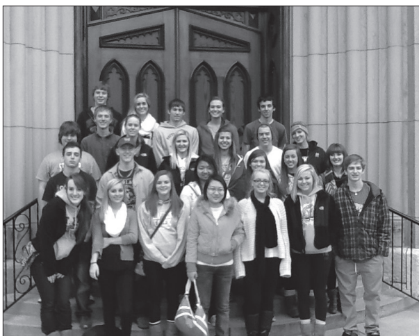
Seniors travel to the University of Notre Dame for their annual retreat