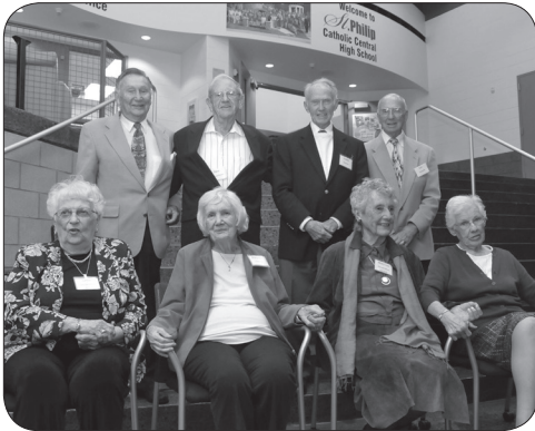
Members of the Class of 1944 celebrate their 68 year reunion