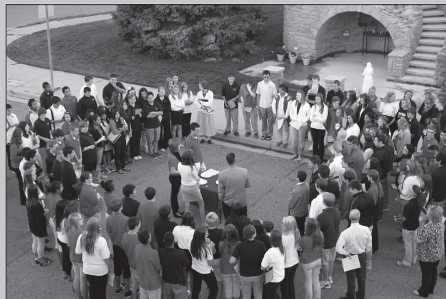
Commemorating the anniversary of 9/11, the high school joined together to pray the Living Rosary