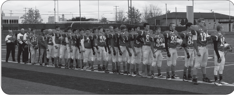
The 2012 St. Philip Tiger Football Team lines up before kickoff