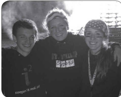
The Homecoming Bonfire continues as an honored tradition