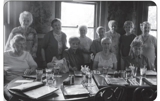
You never know where you will find STP Alumni gathering! Pictured are some of the members of the Classes of 1952, 1953, and 1954